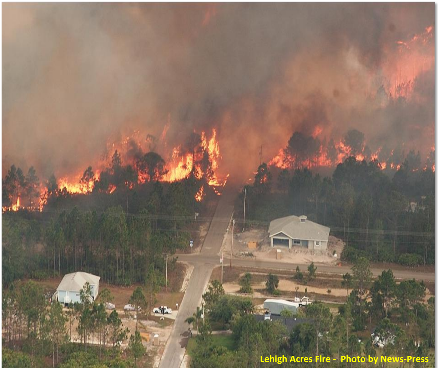
Lehigh Acres Fire